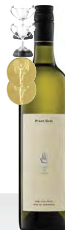
Bird In Hand Pinot Gris 2018

James Halliday, Australian Wine Companion RRP $27