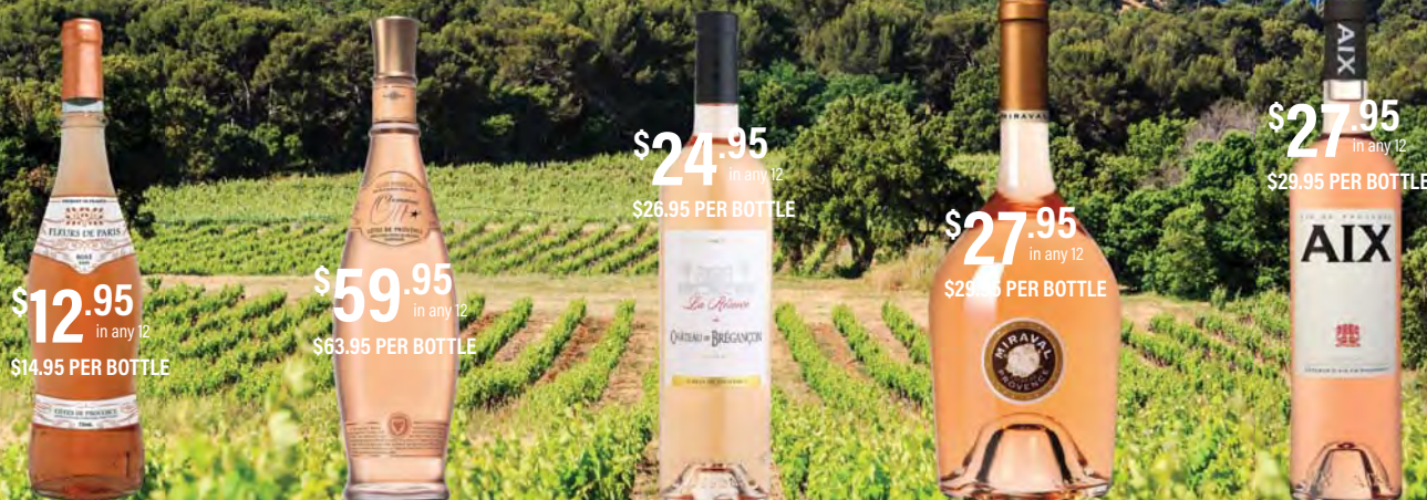
CHATEAU DE BREGANCON VINEYARDS

where consumers are recognising its great synergy with our temperate climate and alfresco lifestyle. Of course Provence rosé is a significant part of the Australian 'Rosé Revolution' with its signature pale salmon-pink colour and delicate but complex aromas and flavours (usually from grenache, cinsault and mourvedre grapes) gently seducing the senses.