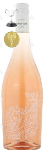
BEST ROSÉ, SYDNEY ROYAL WINE SHOW