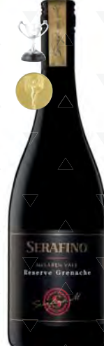
BEST OTHER RED VARIETAL, SYDNEY ROYAL WINE SHOW