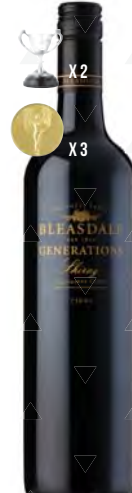
BEST WINE OF SHOW, SYDNEY ROYAL WINE SHOW 2018