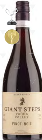
BEST PINOT NOIR, SYDNEY ROYAL WINE SHOW